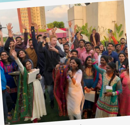
2024 THE BEST PLACE TO WORK!